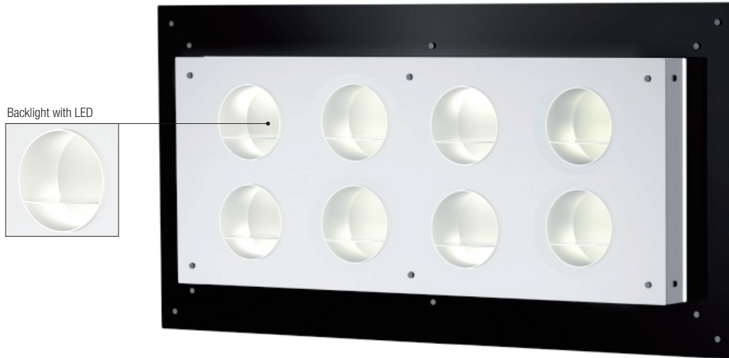
W 18/9 ng