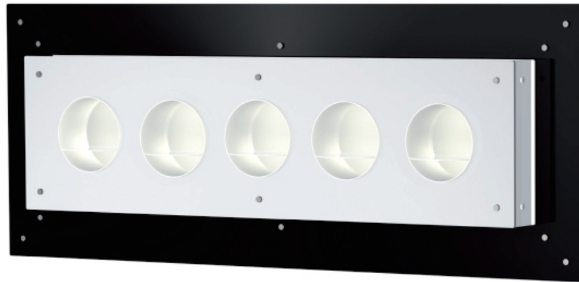
W 18/7 ng